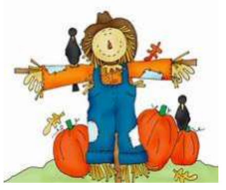
Salem's UMC Trunk or Treat 2023!